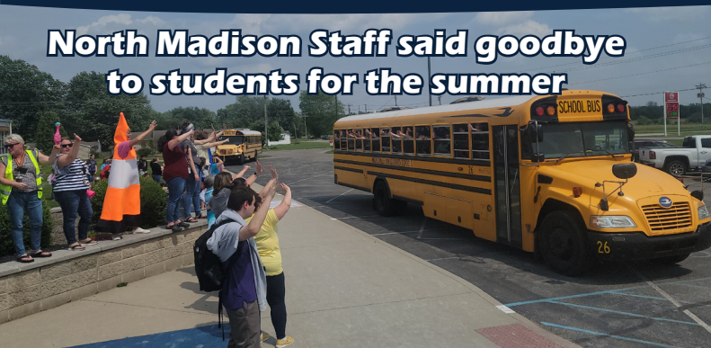
North Madison Staff said goodbye to students for the summer