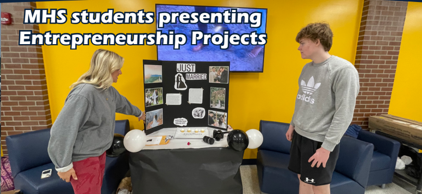
MHS students presenting Entrepreneurship Projects