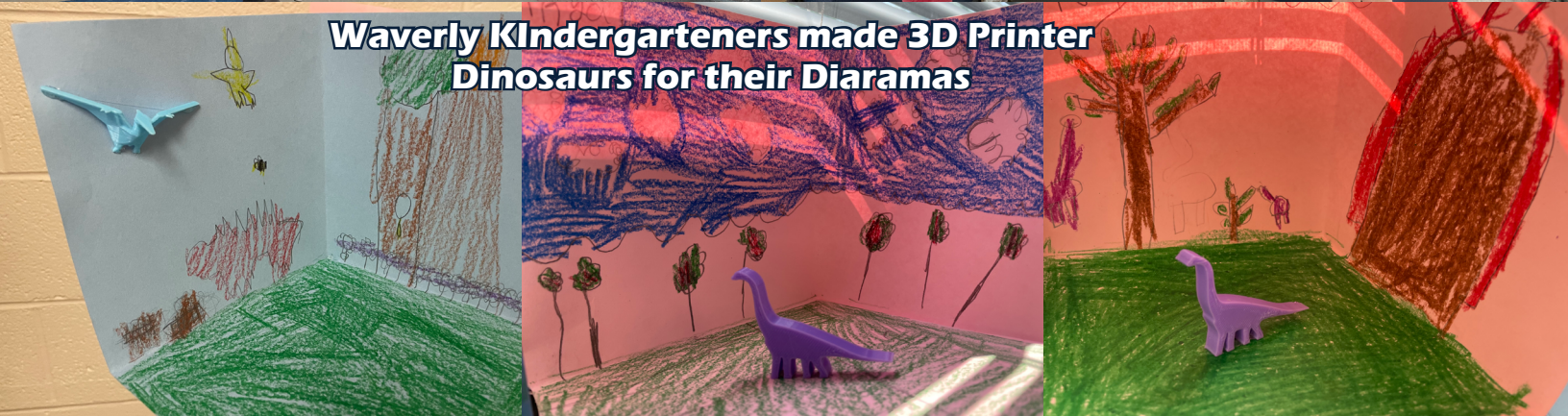
Waverly Kindergarteners made 3D Printer Dinosaurs for their Diaramas