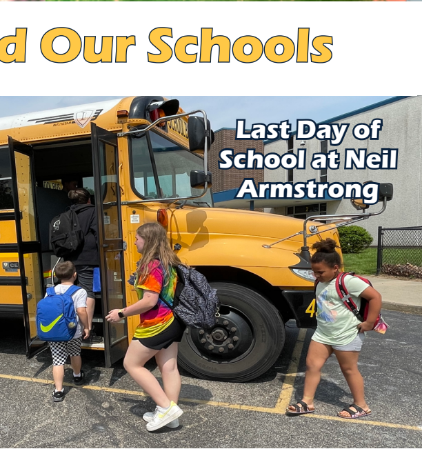
Last Day of School at Neil Armstrong